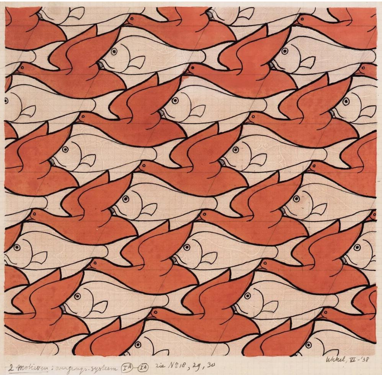
2 Motieven : overgangs-systeem (IA) (IA) zie N o 18, 29, 30